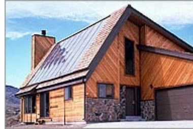
This home in Golden, Colorado uses a liquid-based solar system for space and water heating.

Specialty or custom tanks may be necessary in systems with very large storage requirements. They are usually stainless steel, fiberglass, or high temperature plastic. Concrete and wood (hot tub) tanks are also options. Each type of tank has its advantages and disadvantages. All types require careful consideration for their location, due to their size and weight. It may be more practical to use several smaller tanks rather than one large one. The simplest storage system option is to use standard domestic water heaters. They are designed to meet building codes for pressure vessel